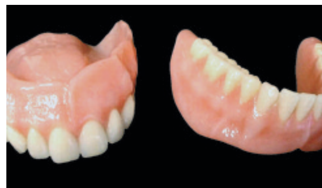
Fig. 7 The completed dentures.