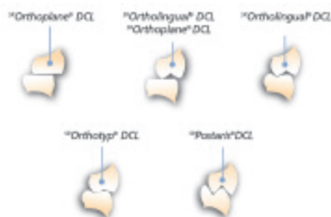
Fig. 5 BlueLine's occlusal scheme options.