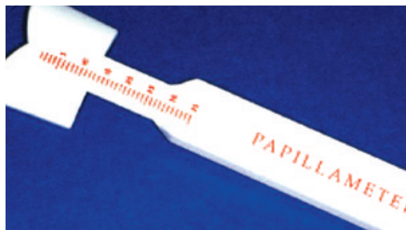
Fig. 4 The Papillameter measures maxillary lip length, determining the optimal amount of incisal display.