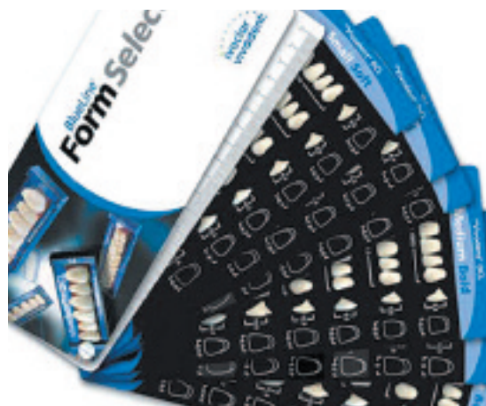
Fig. 3 The appropriate anterior teeth are chosen from the FormSelector.