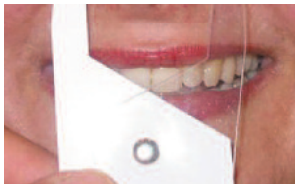
Fig. 1 The FormSelector facial meter measures...

Baseplate fabrication. Standard prosthetic techniques for constructing baseplates to record centric relation and vertical dimension utilize